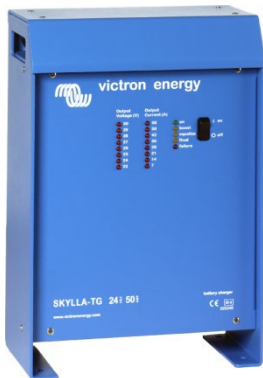
Skylla Charger 24 V 50 A